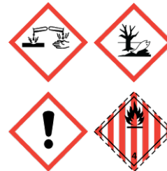
GHS & Chemical products