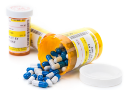
Pharmaceutical products, Body care & Medical Tests

Reduce the complexity, avoid obsolete labels, save time and money.