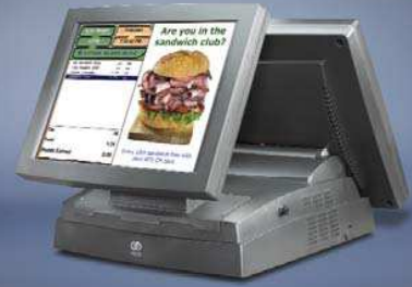
NCR RealPOS 21 featuring 12.1" LCD Customer Display with Integrated Base Mount

For more information, visit www.ncr.com , call 866.431.7879, or email retail.contactus@ncr.com .