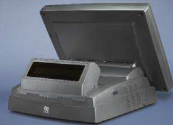
NCR RealPOS 21 with 2 x 20 VFD Customer Display with Integrated Flush Mount