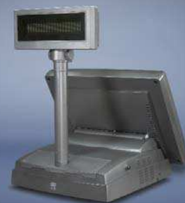
NCR RealPOS 21 with 2 x 20 VFD Customer Display with Integrated Pole Mount