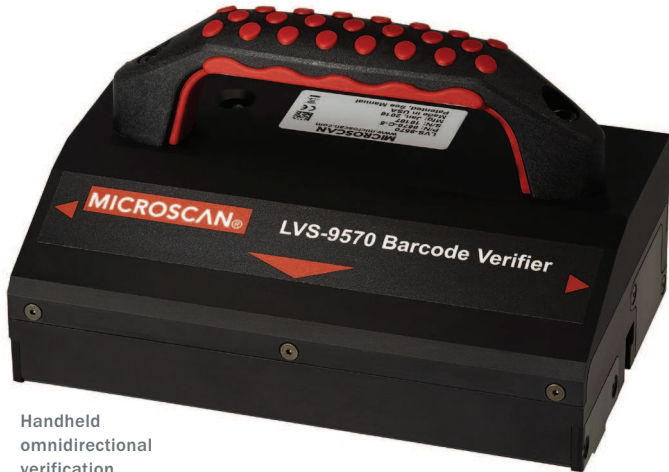
Handheld omnidirectional verification