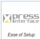
Ease of Setup