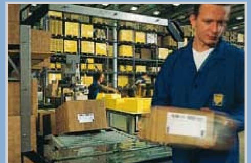
Distribution & Retail