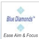
Ease Aim & Focus